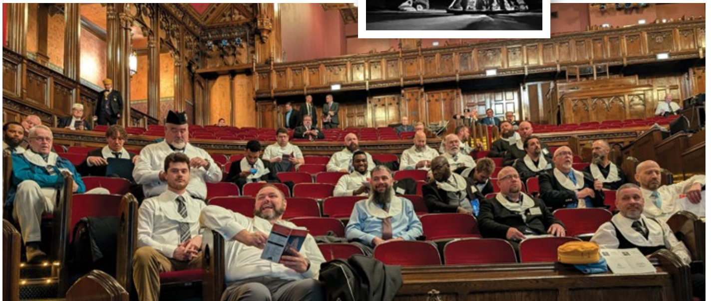
(Bottom) 2025 Fall Convocation Class relaxing in the auditorium.