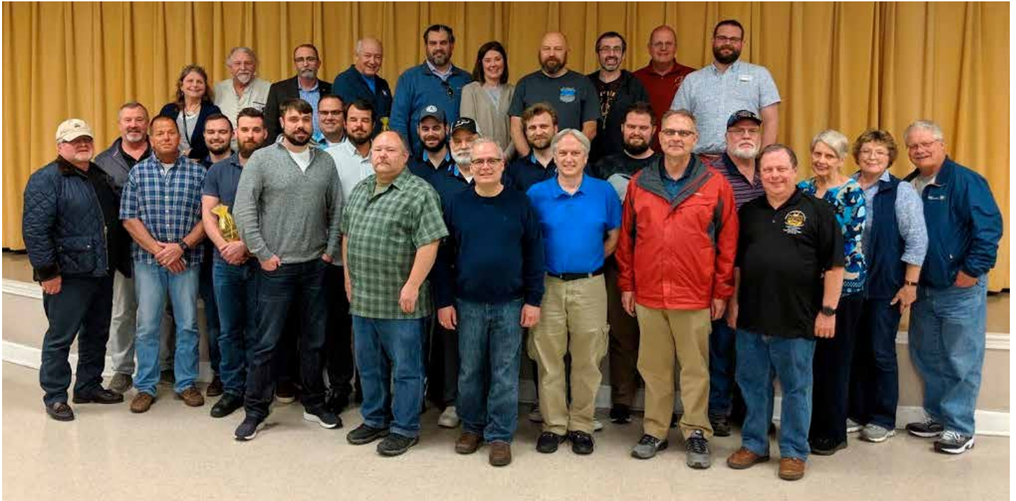
These Brothers and friends of the Indianapolis Valley headed to Bluegrass Country on April 27 for the Kentucky Bourbon Trail Tour. The Tour was sold out in advance and featured the Jim Beam and Maker's Mark distilleries.