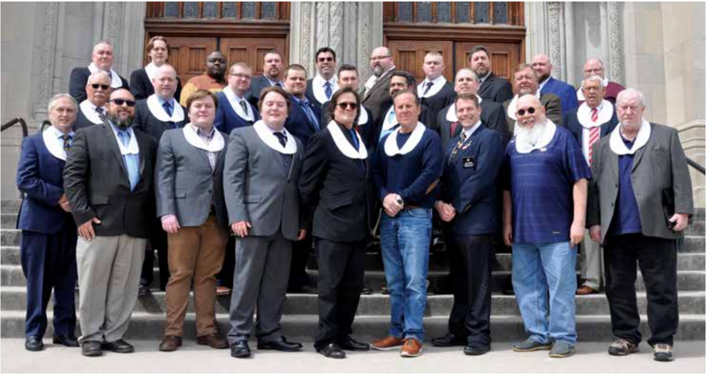
Members of our Spring Class took a few moments to memorialize their April 13 initiation on the steps of our East entrance.