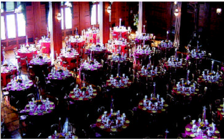
Our Beautiful Ballroom can seat over 600 for an elegant formal dinner.