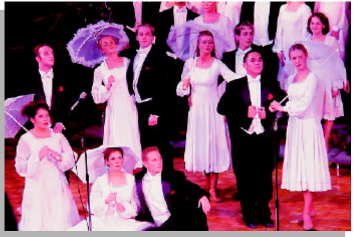
The "Singing Hoosiers" have thrilled audiences around the world and performed to a large Father/Daughter Banquet last month in our renovated auditorium.