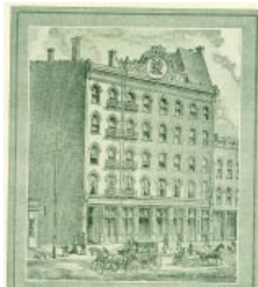
"Pork House" 1883-94

Townsley and Wiggins building located at 29-35 South Pennsylvania Street. Known as the "Pork House" the building was a brick edifice with five stories in the front and six stories in the back.