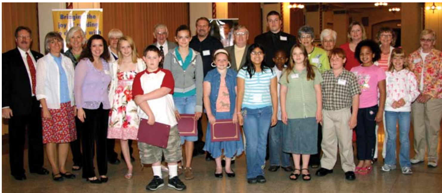
Graduating students, current students, tutors, and board members celebrate the Indianapolis 32° Masonic Learning Center for Children Celebration on Sunday, May 17, 2009.